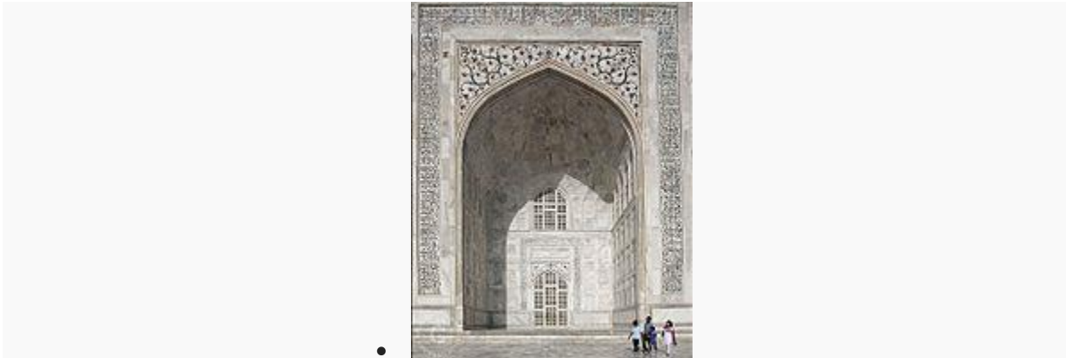
Arabic calligraphy at the tomb entrance