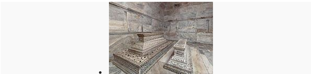
The actual tombs of Mumtaz Mahal (right) and Shah Jahan (left) in the lower level. Notice that Mumtaz's grave does not have a lower slab like that of Shah Jahan