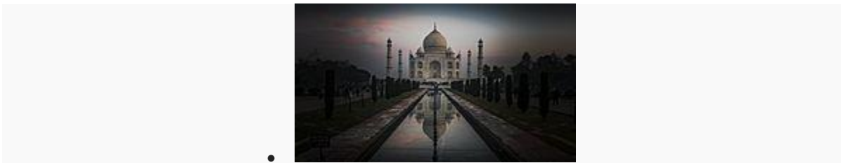
Taj Mahal at sunrise from Main Entrance