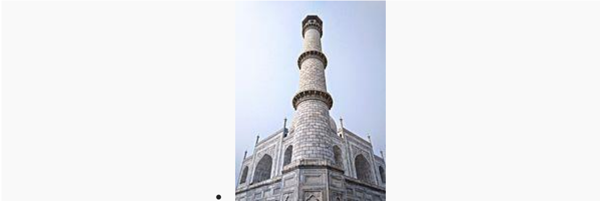
Taj Mahal minaret