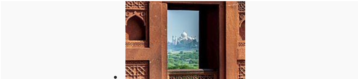
A window view of Taj Mahal from Agra Fort