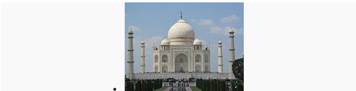
Four minarets frame the tomb.