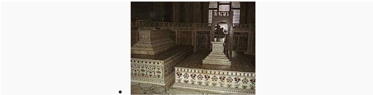
The false sarcophagi of Mumtaz Mahal (right) and Shah Jahan (left) in the main chamber