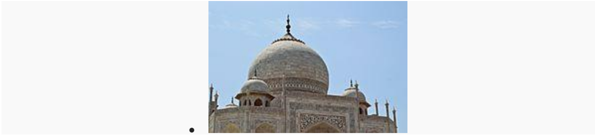
Main marble dome, smaller domes, and decorative spires that extend from the edges of the base walls